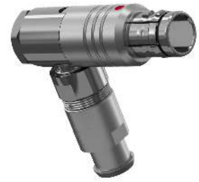
POSITIONS: 10 Positions