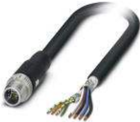
Assembled Ethernet cable, CAT5e, shielded, 8-wire, 4 x 26 AWG (data) and 4 x 20 AWG (power), RAL 9005 (black), M12 hybrid plug to free cable end, length: 1.0 m

Please be informed that the data shown in this PDF Document is generated from our Online Catalog. Please find the complete data in the user's documentation. Our General Terms of Use for Downloads are valid ( http://download.phoenixcontact.com )