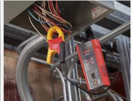
Intuitive transmitter automatically senses whether the system is energized or de-energized