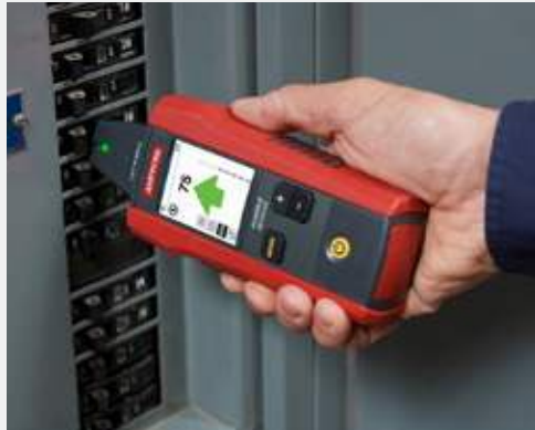
Reduce downtime with immediate and unambiguous breaker identification