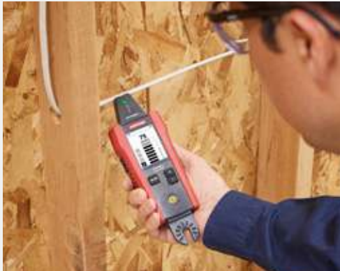
Most accurate wire tracing in its class with eight sensitivity modes