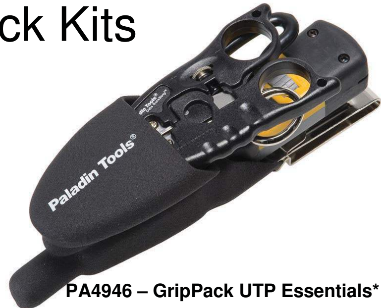
PA4946 – GripPack UTP Essentials*

Same features as other GripPacks; securely holds tools in place, swiveling quick release belt clip..