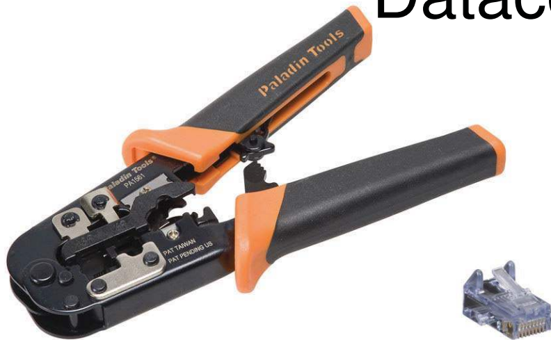
PA1561 – All-in-One UTP Snagless Crimper

Professional, fully ratcheting UTP crimper for standard and ‘snagless” RJ45 connectors. Also crimps RJ11/22 and RJ 22 WE/SS style plugs.