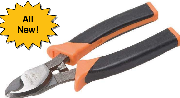
PA1175 – Contour Round Cable Cutter

New cutter for larger diameter cable with ProGrips for improved comfort and control. Features include: