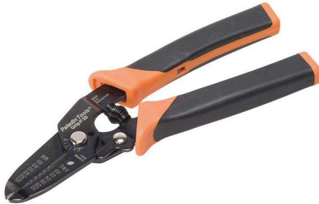
PA1117 Wire Stripper 22-10 AWG* PA1118 Wire Stripper 30-20 AWG * PA1123 Wire Stripper Bundle *

Upgraded existing products with dual-material ProGrips for improved comfort and control