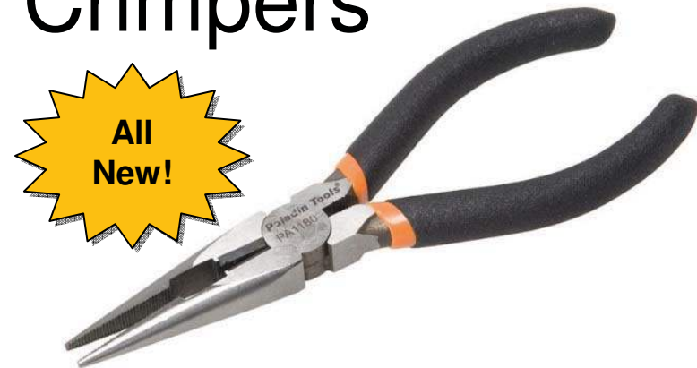
PA1180 – 4-in1 Telecom Splice Crimper*

Professional telecom tool for button-style splice connectors. Crimp cavity: