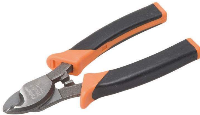
PA1179 –Dual-Contour Round Cable Cutter

Upgraded PA900265 with ProGrips for improved comfort and control. Features include: