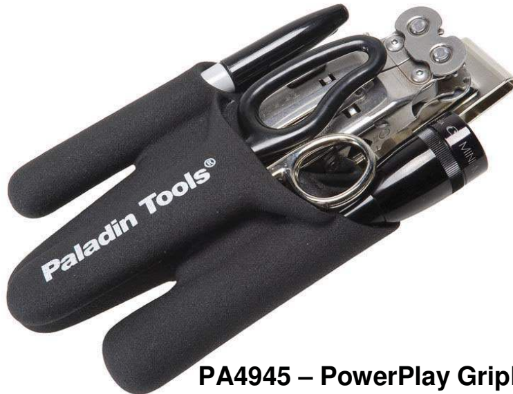
PA4945 – PowerPlay GripPack*

Same features as other GripPacks; securely holds tools in place, swiveling quick release belt clip. This version holds PT-540 in open or closed position. Includes: