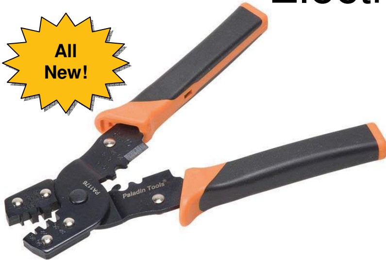
PA1176 – Electrical Terminal Crimper