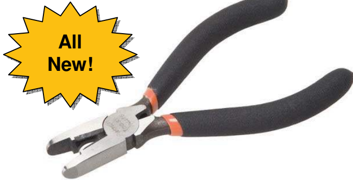
PA1178 – Telecom Splice Crimper

Professional telecom tool for button-style splice connectors. Crimp cavity: