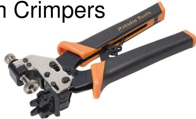
PA1559 – SealTite ProM Coax Crimper

Professional, fully ratcheting coax compression crimper for standard and “mini” CATV-F, RCA and BNC connectors for RG59, RG6, RG6Q and RG58 cables. Also accommodates right-angle connectors. Dual-material grips for improved comfort and control.