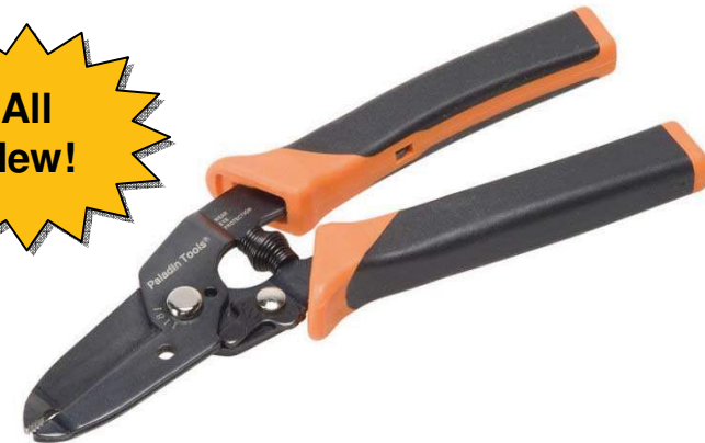
PA1181 Flat Cable Cutter Professional cutting tool for electronic and computer applications.

Cut flat satin cables easily and quickly Gripping pliers at tip of the tool ProGrips for improved comfort and control