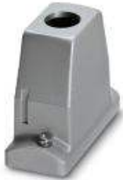
HEAVYCON ADVANCE EMV sleeve housing B16, with screw locking, height 100 mm, with 1x M32 thread, straight cable outlet

Please be informed that the data shown in this PDF Document is generated from our Online Catalog. Please find the complete data in the user's documentation. Our General Terms of Use for Downloads are valid ( http://download.phoenixcontact.com )