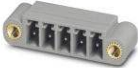
The figure shows the 5-pos. version of the product in gray

Header, Nominal current: 8 A, Rated voltage (III/2): 160 V, Number of positions: 7, Pitch: 3.81 mm, Color: black, Contact surface: Tin, Mounting: Wave soldering