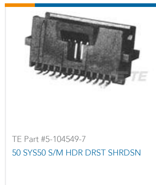
TE Part #5-104549-7 50 SYS50 S/M HDR DRST SHRDSN