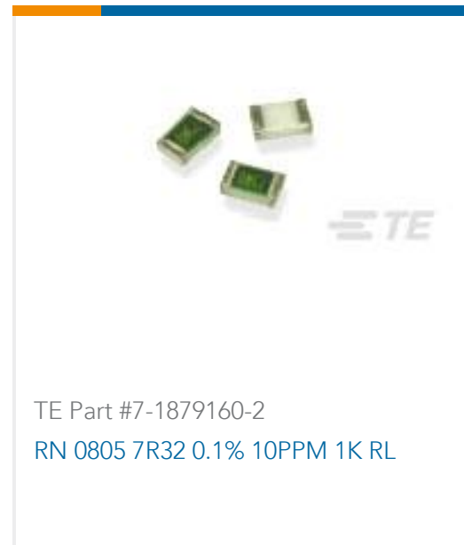
TE Part #7-1879160-2 RN 0805 7R32 0.1% 10PPM 1K RL