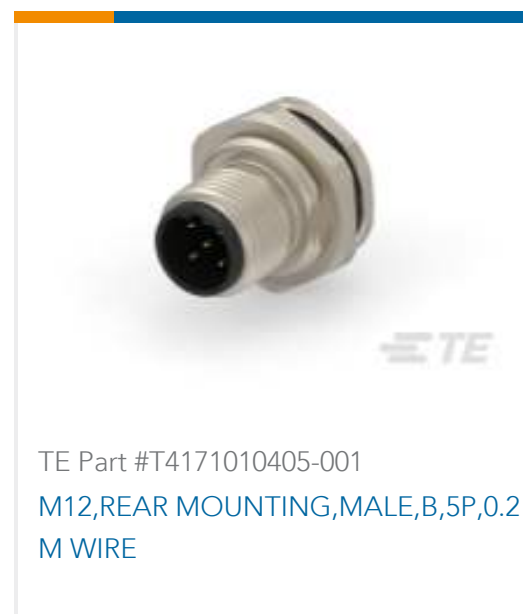
TE Part #T4171010405-001 M12,REAR MOUNTING,MALE,B,5P,0.2 M WIRE