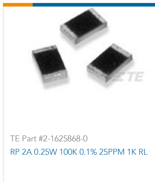
TE Part #2-1625868-0 RP 2A 0.25W 100K 0.1% 25PPM 1K RL