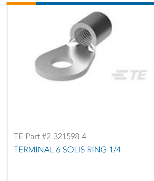
TE Part #2-321598-4 TERMINAL 6 SOLIS RING 1/4