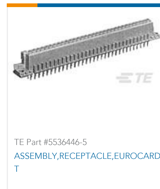
TE Part #5536446-5 ASSEMBLY,RECEPTACLE,EUROCARD, T