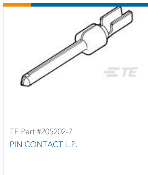
TE Part #205202-7 PIN CONTACT L.P.