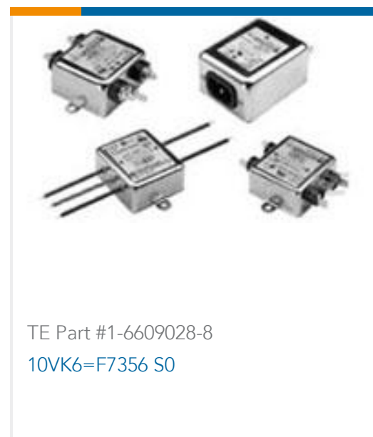
TE Part #1-6609028-8 10VK6=F7356 S0