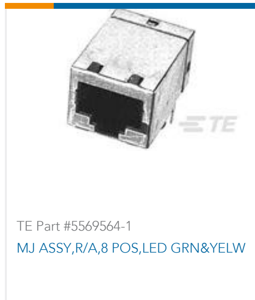
TE Part #5569564-1 MJ ASSY,R/A,8 POS,LED GRN&YELW