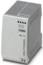
Primary-switched UNO power supply for DIN rail mounting, input: single-phase, output: 12 V DC/100 W

Please be informed that the data shown in this PDF Document is generated from our Online Catalog. Please find the complete data in the user's documentation. Our General Terms of Use for Downloads are valid ( http://phoenixcontact.com/download )