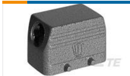
TE Part #1106430-4 HB.10.STS.1.M25.G