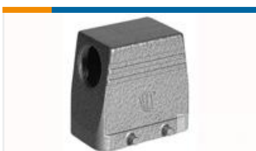
TE Part #1106434-4 HD.24.STS.1.M32.G