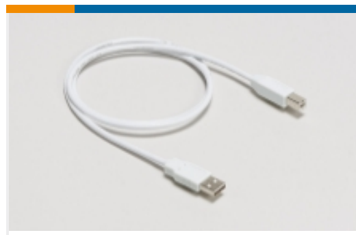
USB Cable Assemblies(1)