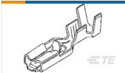
TE Part #173691-1 PL 187 REC 20-16 AWG 0.3 X 14.0 PTBR