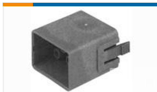
TE Part #1103017-1 MDL2.HN.D.15.STI.C