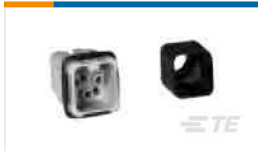
TE Part #2-1103100-3 HN.D.7.STI.C. 250 V