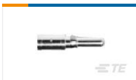
TE Part #5-1105250-1 HSM-C-Sti.Ag.6 qmm