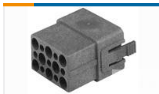
TE Part #1103017-2 MDL2.HN.D.15.BU.C