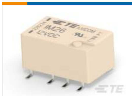
TE Part #3-1462039-1 IM26GR=IM RELAY 50mW 12V