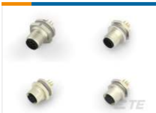
TE Part #T4140012051-000 M12 Panel Mount PCB