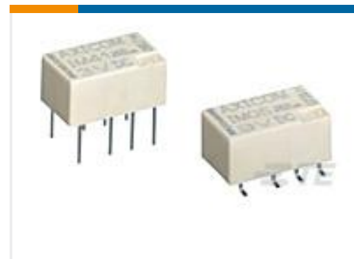
TE Part #3-1462037-4 IM05GR=IM RELAY 140mW 9V