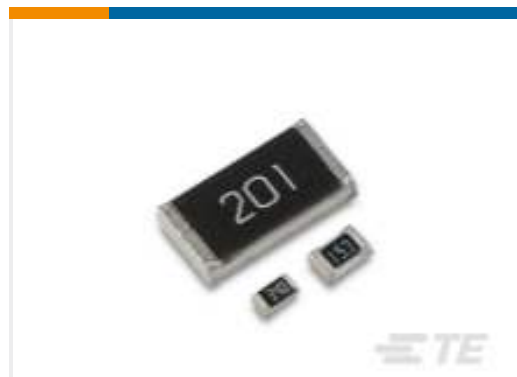
TE Part #4-2176330-6 CRGP 2010 56K 1%