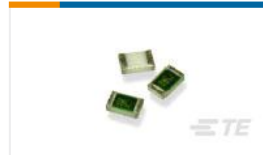
TE Part #1879338-6 CPF 0603 30K1 1% 50PPM 1K RL