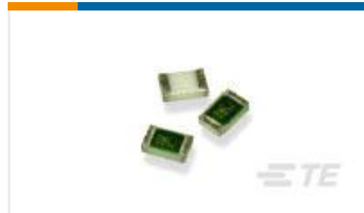
TE Part #4-1879208-7 CPF 0402 820R 0.1% 25PPM 1K RL