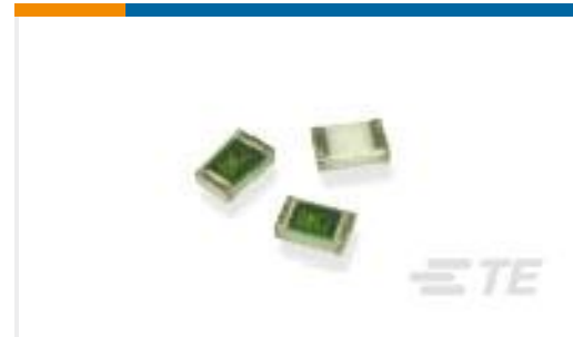
TE Part #2-2176088-3 RP 1J 0.166W 1K3 0.1% 25PPM 1K RL