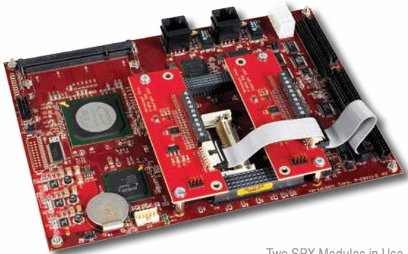
Two SPX Modules in Use