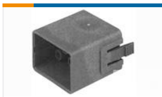
TE Part #1103017-1 MDL2.HN.D.15.STI.C