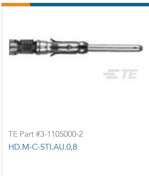
TE Part #3-1105000-2 HD.M-C-STI.AU.0,8