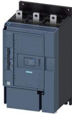
SIRIUS soft starter 200-480 V 470 A, 110-250 V AC spring-type terminals Thermistor input