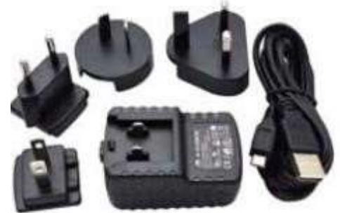
*Product images are for illustrative purposes only and may vary from actual design.