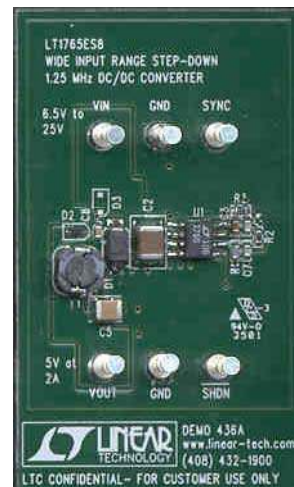
Figure 1... Quick Start connections for DC436A.