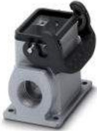
HEAVYCON box mounting base B6, with single locking latch. Height 74 mm, with supports 2x M32

Please be informed that the data shown in this PDF Document is generated from our Online Catalog. Please find the complete data in the user's documentation. Our General Terms of Use for Downloads are valid ( http://phoenixcontact.com/download )