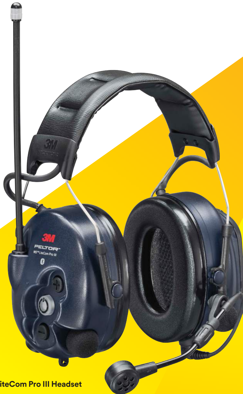
3M™ PELTOR™ WS™ LiteCom Pro III Headset