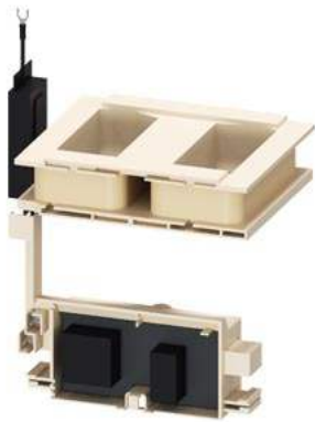
Magnet coil with switch-on electronics for contactor 3TF6844-.C..., 380...460 V AC 50/60 Hz