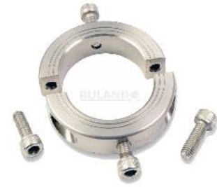
*Additional hardware not included