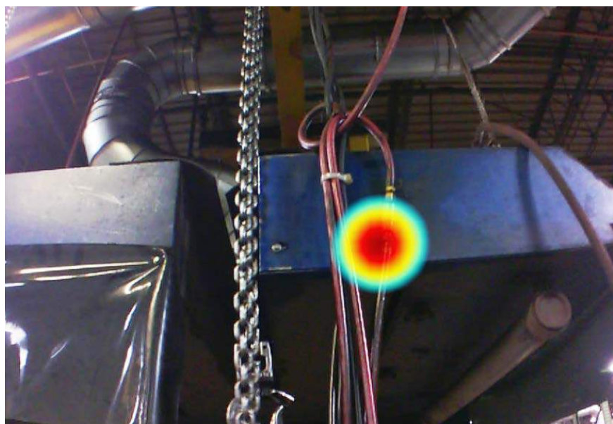
Images taken with the ii900 Sonic Industrial Imager in an industrial environment.

Fluke. Keeping your world up and running.®