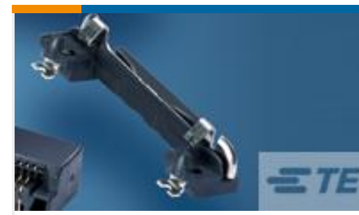
TE Part #1717832-2 MINI PCI EXPRESS EMBOSS TAPE LATCH