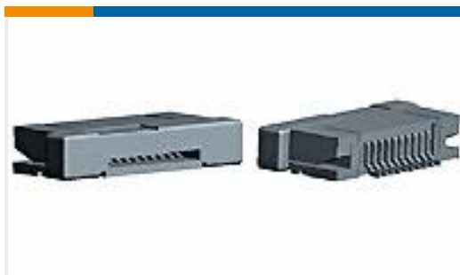
TE Part #2-1734592-2 FPC CONN. 0.5MM PITCH B/C, 22P