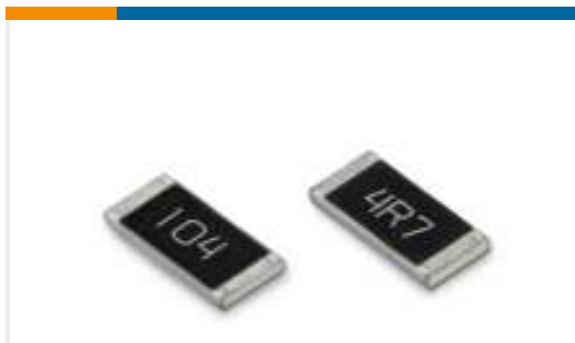
TE Part #4-2176455-9 CPF 0402 348K 0.1% 25ppm 1K RL