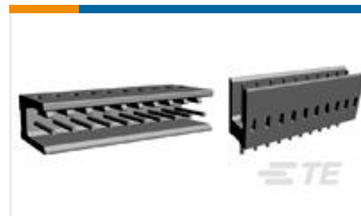
TE Part #826467-3 3P MOD II SHROUDED HEADER, ST