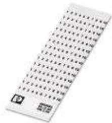
Marker cards, white, Mounting type: Adhesive, For terminal block width: 2.54 mm

Please be informed that the data shown in this PDF Document is generated from our Online Catalog. Please find the complete data in the user's documentation. Our General Terms of Use for Downloads are valid ( http://download.phoenixcontact.com )