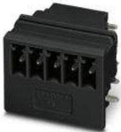
PCB terminal block

Please be informed that the data shown in this PDF Document is generated from our Online Catalog. Please find the complete data in the user's documentation. Our General Terms of Use for Downloads are valid ( http://phoenixcontact.com/download )