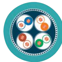
Ethernet 10 Gbit [94F]