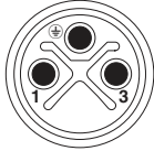
Pin assignment of M12 plug, 3-pos., S-coded, view of pin side