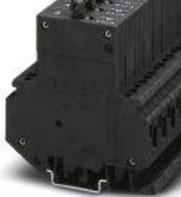
Thermomagnetic circuit breaker, 1-pos., fast blow, 1 N/C contact, with universal foot for mounting on NS 32 or NS 35

Please be informed that the data shown in this PDF Document is generated from our Online Catalog. Please find the complete data in the user's documentation. Our General Terms of Use for Downloads are valid ( http://download.phoenixcontact.com )