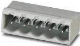
The figure shows a 5-pos. version of the product in gray

Header, Nominal current: 12 A, Rated voltage (III/2): 320 V, Number of positions: 16, Pitch: 5.08 mm, Color: black, Contact surface: Tin, Mounting: Wave soldering