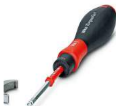
Torque screwdriver, series: RC

https://www.phoenixcontact.com/pc/products/1607456