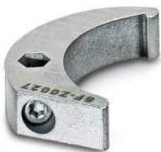
Hook wrench, series: RC

https://www.phoenixcontact.com/pc/products/1607455