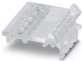
Ejector for COMBICON plug

Please be informed that the data shown in this PDF Document is generated from our Online Catalog. Please find the complete data in the user's documentation. Our General Terms of Use for Downloads are valid ( http://phoenixcontact.com/download )