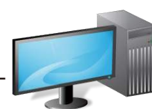
Monitor & Record