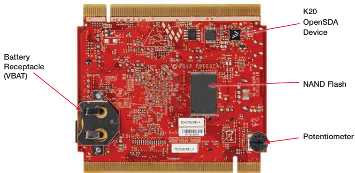
Back Side of TWR-VF65GS10 Module