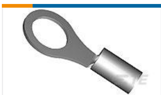
TE Part #33695 TERMINAL,BUDG R 26-22 2