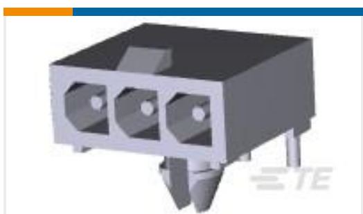
TE Part #1-770967-0 03P MINI UMNL R/A HDR ASSY SN