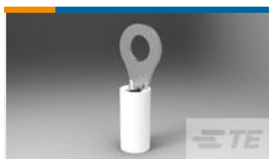
TE Part #152873 14-12 PIDG NYLON RT NO 8 WHITE