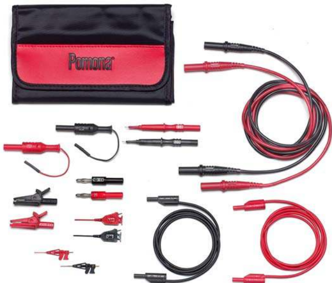
Model 72928 SMD Multi-Use Test Kit

Everything you need for SMD Test with your DMM in one kit