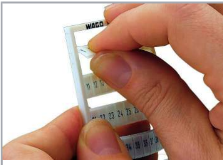
Separating a strip from the WMB or WMB marker card.