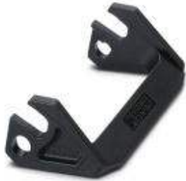
Replacement single locking latch for HEAVYCON EVO housing type B16, PA

Please be informed that the data shown in this PDF Document is generated from our Online Catalog. Please find the complete data in the user's documentation. Our General Terms of Use for Downloads are valid ( http://phoenixcontact.com/download )