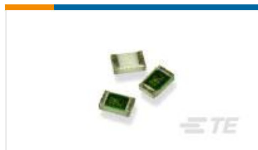
TE Part #1879337-7 CPF 0603 2K87 1% 50PPM 1K RL