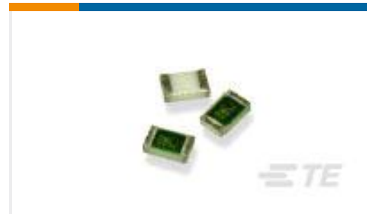
TE Part #4-1879336-5 CPF 0603 665R 1% 50PPM 1K RL