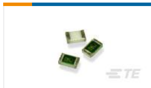
TE Part #3-1879336-9 CPF 0603 576R 1% 50PPM 1K RL