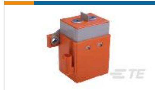
TE Part #4-1904065-7 V23720A0002A001-EV-CBOX