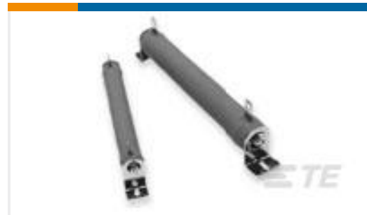
TE Part #1-1879457-8 TE 2500W 27R 5% Bracket