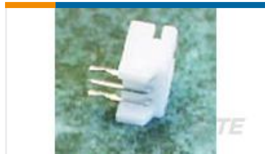
TE Part #440055-4 2.0MM,HDR,4POS,R/A