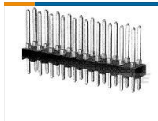
TE Part #1-87227-3 26 MODII HDR DRST UNSHRD .100