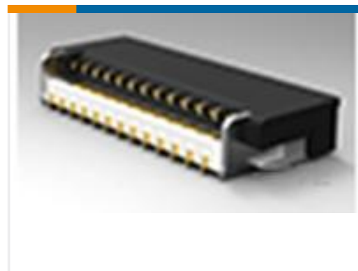
TE Part #1-2040832-6 EMBOSS TAPING 0.25FPC BF-L-1.3