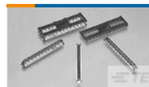
TE Part #3-5353606-7 .5FHR04H,240,S,GIG,08/Sn,HT,NS