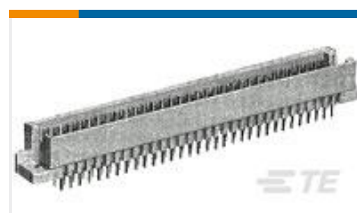
TE Part #5650933-5 ASSY,PIN,EUROCARD,TYPE R,LEAD-