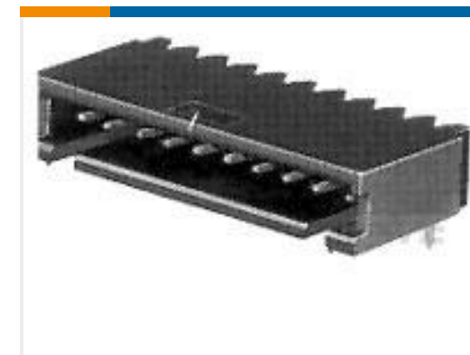
TE Part #5-102203-4 07 MODII HDR SRRA SHRD LF