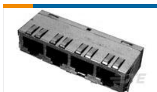
TE Part #6339167-3 ASSY,SHLD,1X4,MJ,WAVE PNL