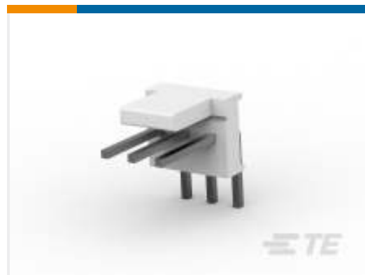
TE Part #640455-5 PCB Header: Polyester, Right Angle, 2.54 mm