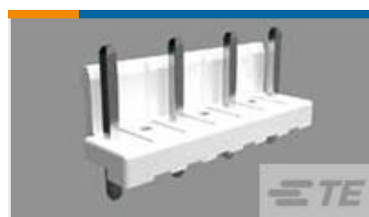
TE Part #1-1318301-4 3.96EP HDR ASSY 4(7)P NAT/TUBE