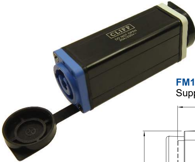
FM12320 - CLIFFCON-P IN/OUT COUPLER. Supplied with black dust caps fitted.