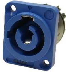
FM12300 - CLIFFCON-P POWER IN SOCKET IP65