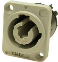
FM12315 - CLIFFCON-P POWER OUT SOCKET IP65