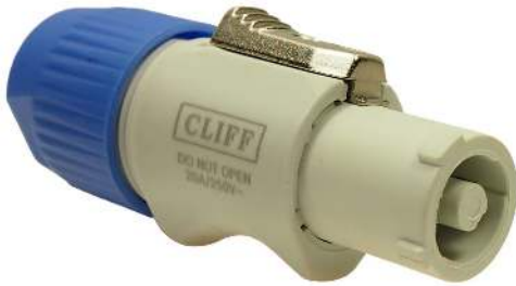
FM12301 - CLIFFCON-P POWER IN PLUG IP65