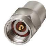
Generic photo used for illustration purposes only