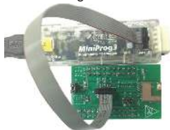
Fig 3: Programming/Debugging with MiniProg3

Connect the MiniProg3 to the J4 10-pin header