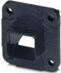
Panel mounting frames, Degree of protection: IP65/67, Material: Plastic

Please be informed that the data shown in this PDF Document is generated from our Online Catalog. Please find the complete data in the user's documentation. Our General Terms of Use for Downloads are valid ( http://phoenixcontact.com/download )