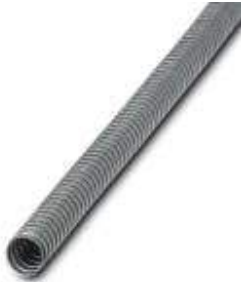
Protective hose in galvanized steel

Please be informed that the data shown in this PDF Document is generated from our Online Catalog. Please find the complete data in the user's documentation. Our General Terms of Use for Downloads are valid ( http://phoenixcontact.com/download )