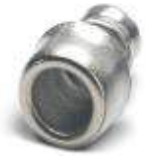
End sleeves as cable protection, made of brass