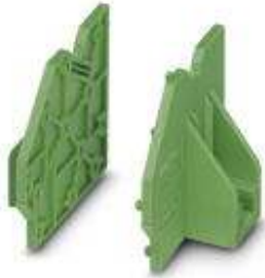
Pair of flanges, can be snapped onto a row of single terminal blocks

Please be informed that the data shown in this PDF Document is generated from our Online Catalog. Please find the complete data in the user's documentation. Our General Terms of Use for Downloads are valid ( http://phoenixcontact.com/download )