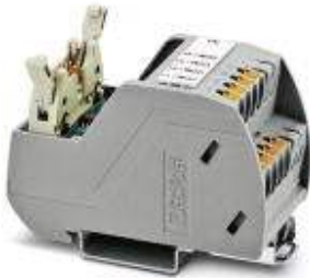
VARIOFACE Professional (VIP) board for the ROC800 controller

Please be informed that the data shown in this PDF Document is generated from our Online Catalog. Please find the complete data in the user's documentation. Our General Terms of Use for Downloads are valid ( http://phoenixcontact.com/download )