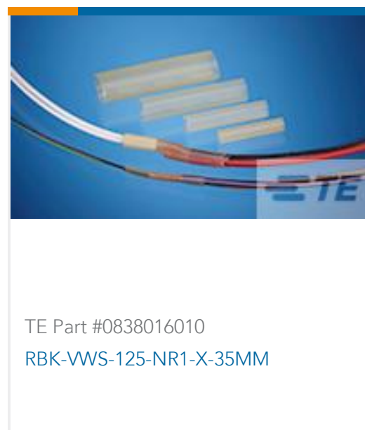
TE Part #0838016010 RBK-VWS-125-NR1-X-35MM