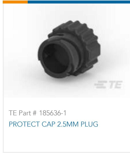
TE Part # 185636-1 PROTECT CAP 2.5MM PLUG