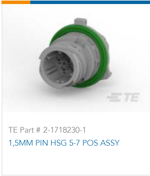
TE Part # 2-1718230-1 1,5MM PIN HSG 5-7 POS ASSY