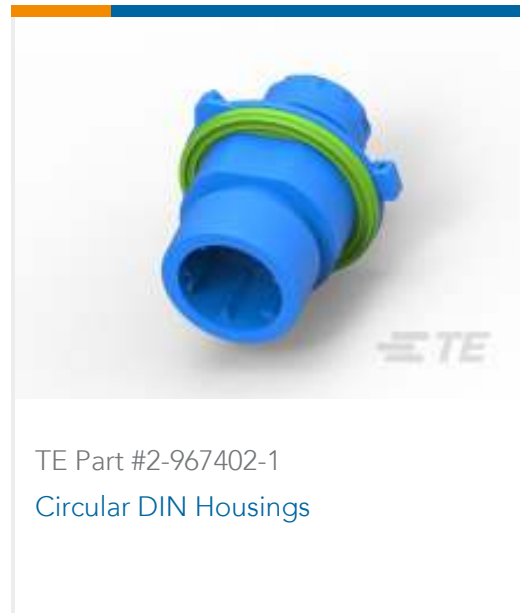
TE Part #2-967402-1 Circular DIN Housings