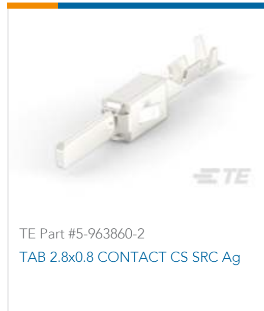
TE Part #5-963860-2 TAB 2.8x0.8 CONTACT CS SRC Ag