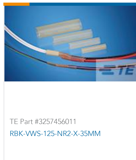
TE Part #3257456011 RBK-VWS-125-NR2-X-35MM