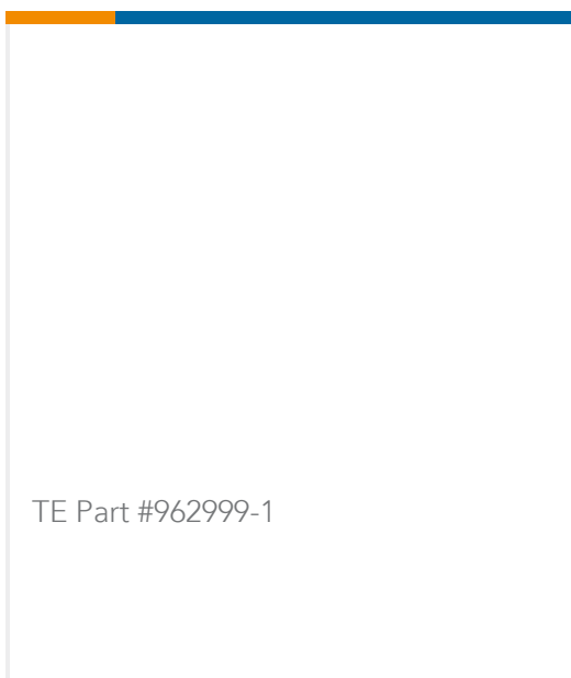
TE Part #962999-1