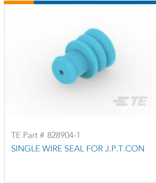
TE Part # 828904-1 SINGLE WIRE SEAL FOR J.P.T.CON