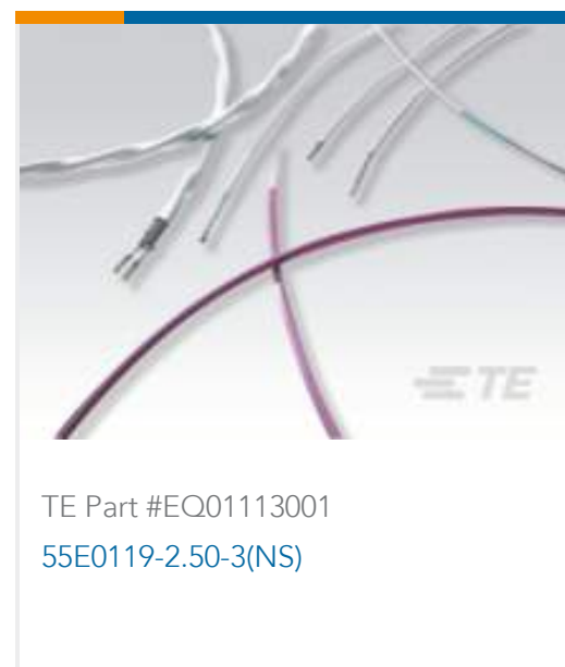
TE Part #EQ01113001 55E0119-2.50-3(NS)