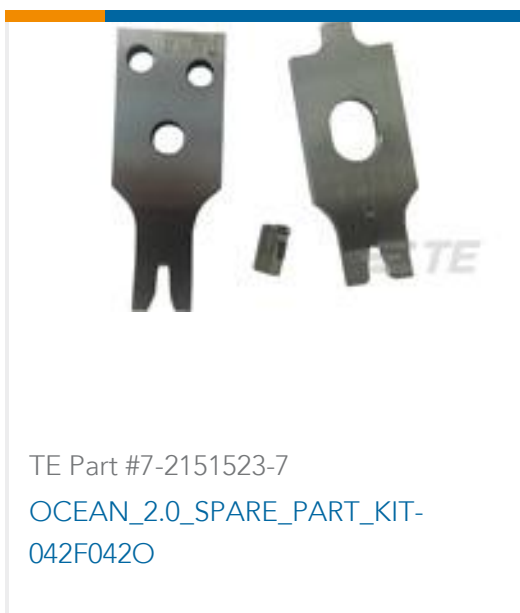
TE Part #7-2151523-7 OCEAN_2.0_SPARE_PART_KIT-042F042O