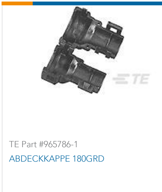
TE Part #965786-1 ABDECKKAPPE 180GRD