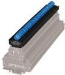
Protective plug with varistor for TERMITRAB base element TT-UKK5-T-BE, nominal voltage: 24 V DC

Please be informed that the data shown in this PDF Document is generated from our Online Catalog. Please find the complete data in the user's documentation. Our General Terms of Use for Downloads are valid ( http://download.phoenixcontact.com )