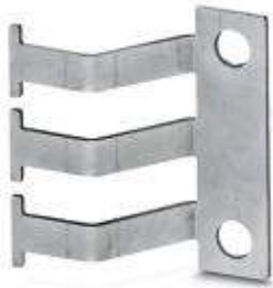
EMC cable catch rail

Please be informed that the data shown in this PDF Document is generated from our Online Catalog. Please find the complete data in the user's documentation. Our General Terms of Use for Downloads are valid ( http://phoenixcontact.com/download )