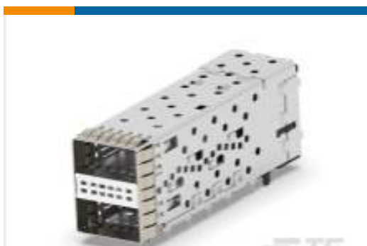
TE Part #2298896-4 2X1 QSFP+ SPRING CAGE AND CONN W/O LP