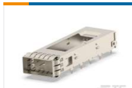
TE Part #2337376-1 CAGE ASSEMBLY, QSFP28 1X1, PCI, OP