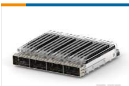
TE Part #2349642-3 CAGE ASSY, 1X4, QSFP28, SPRING, HS, LP