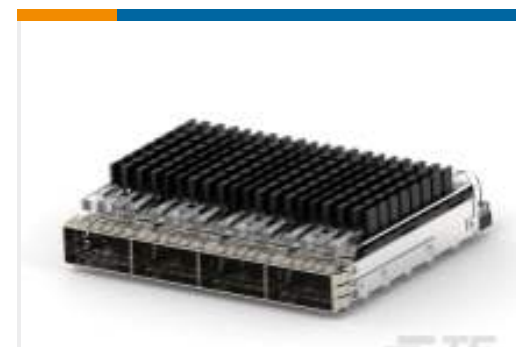
TE Part #2349642-2 CAGE ASSY, 1X4, QSFP28, SPRING, HS, LP