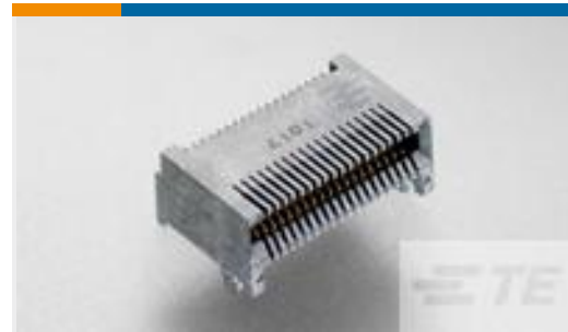
TE Part #2110819-1 QSFP+ Enh EVERCLEAR PT Conn