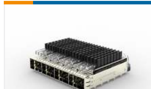
TE Part #2170790-2 CAGE ASSY, 1X4, QSFP28, SPRING, HS, LP