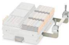
Axioline shield connection set (contains 2 shield bus holders and 2 SK 5 shield connection clamps)

https://www.phoenixcontact.com/us/products/2700518