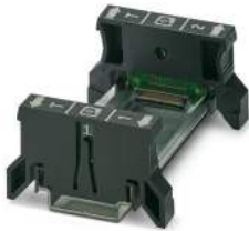
Axioline P terminator pair

https://www.phoenixcontact.com/us/products/2316402