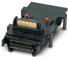
Axioline P bus base module for housing type F2

https://www.phoenixcontact.com/us/products/1052428